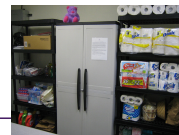
Personal Care Pantry